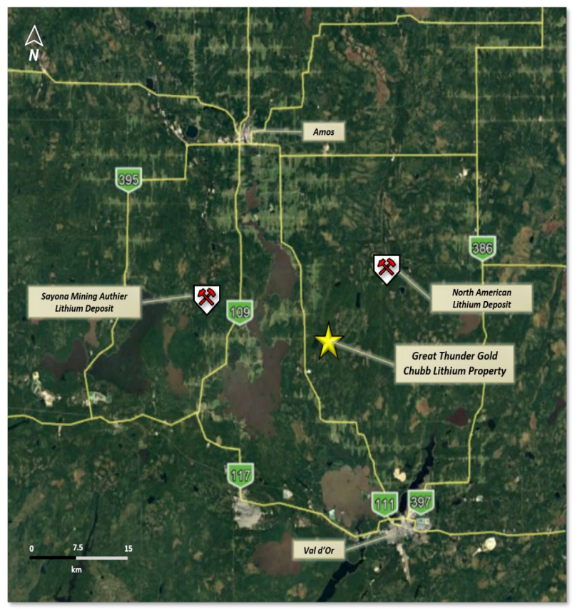
Figure 3: Regional location of the Chubb Property within the La Corne Pluton

In 2016, the Company optioned the Chubb lithium project located near Val d'Or, Quebec. In 2017, it exercised that option and acquired 100% of the claims, subject to a 1% net smelter returns