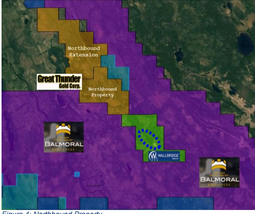
Figure 4: Northbound Property

The Northbound gold property, contiguous to the northwest of the Wallbridge Mining Company Ltd. Fenelon Gold Deposit, is approximately located 85 kilometres northwest of the town of Matagami in northern Quebec. Canada. The Northbound property totals 56 claims mineral covering approximately 3,076 hectares.